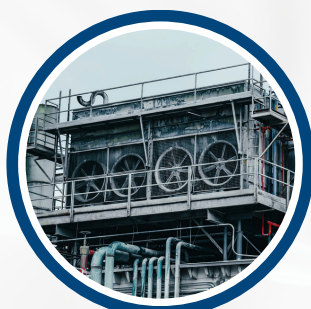
Liquid cooling & processing systems (TP 11)