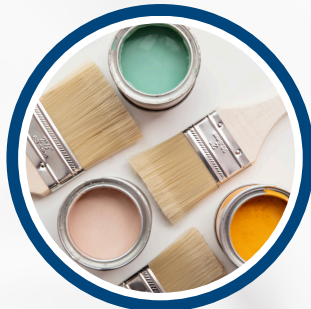
Storage and In can preservation (TP 6)