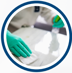
Disinfectants and Algaecides (TP 2)