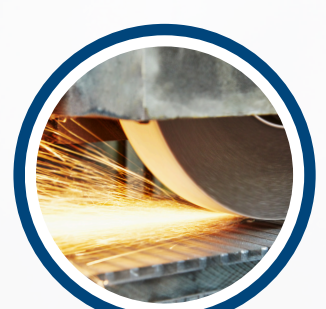
Working or cutting fluids (TP 13)