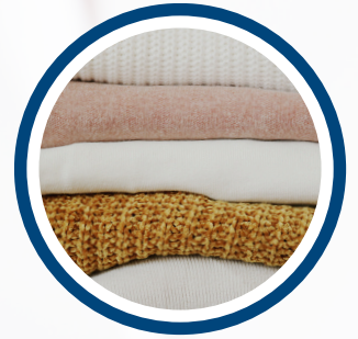
Fibers = Textile, leather and rubber (TP 9)