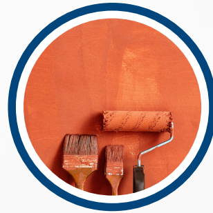
Dry films preservation (TP 7)